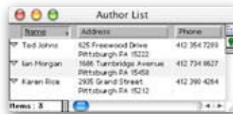
Image Attachment and AutoLink

Using a simple naming convention, this powerful feature automatically connects advertising and editorial elements with graphic files stored within a predefined folder structure. Proteus currently supports PDF and Pict file formats.